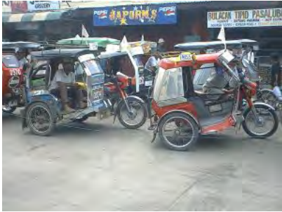
Tricycle Return to text