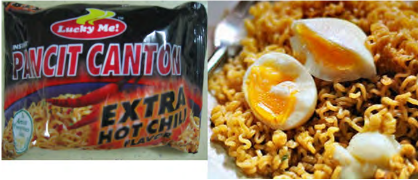
Pancit with Egg. return to text