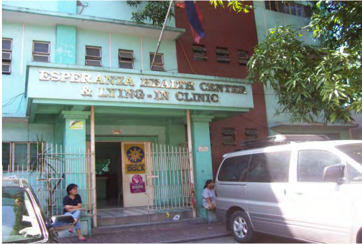
Lying-in Clinic Return to text.