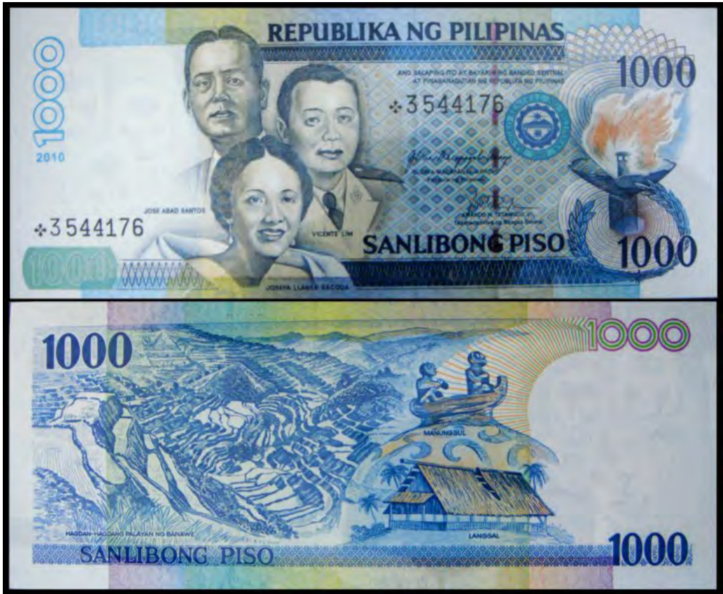
1000 Peso note