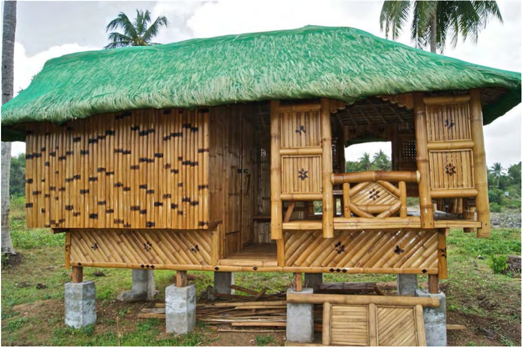
Babay Kubo, also called a Nipa Hut. Return to text.