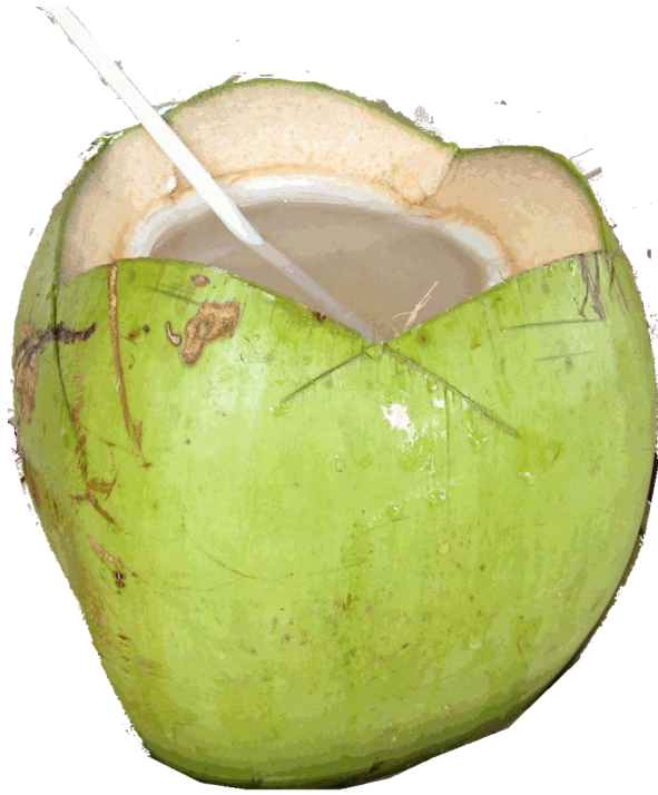
Buko, a young Coconut. Inside a copious amount of juice.